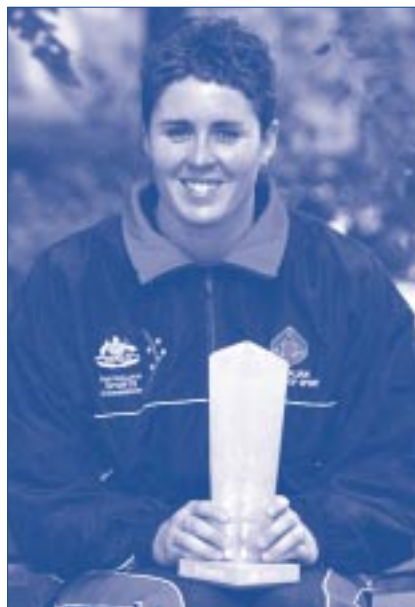
Petria Thomas — 2002 AIS Athlete of the Year

This is a new award that recognises that athletes do not achieve success in elite sport without the support of their coaches. The AIS has been blessed with high-quality coaches it has been able to attract both from Australia and overseas. The AIS is also confident that it has been able to contribute to the careers of many of these coaches, some of whom have gone on to coach successfully elsewhere.